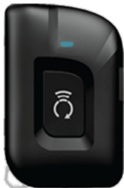
Micro USB Charging port

Your handheld remote control contains a long-lasting Li-Ion battery that can be recharged with a micro-USB cable (supplied). It is recommended that the battery be fully charged before the first use for maximum efficiency and range. During normal operation, the battery will last for approximately 1 month before recharging is required.